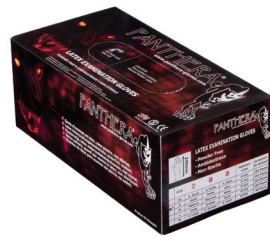
Panthera Powder Free Latex Disposable Examination Gloves Non sterile, Polymer Coated, Ambidextrous, Beaded Cuff

Declare that the following new and unopened Medical Device described below: